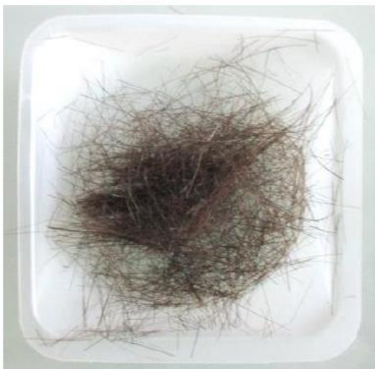
1g of hair before grinding

After 3 runs of 20s on the Precellys Evolution*, the hair is fully ground.