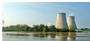
Ring monitoring for nuclear facilities