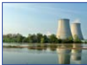
Perimeter monitoring for nuclear facilities