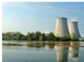
Perimeter monitoring for nuclear facilities