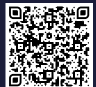
Discover our solutions