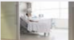
Biomedical & Health