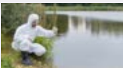
Pollution & Environment