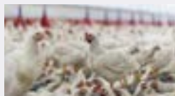
Food / Pharma / Veterinary / Industry